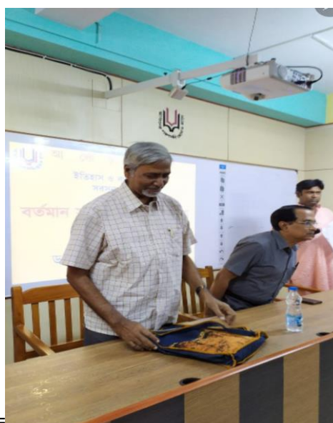
Celebration of Periodic Table Day & Mother Language Day